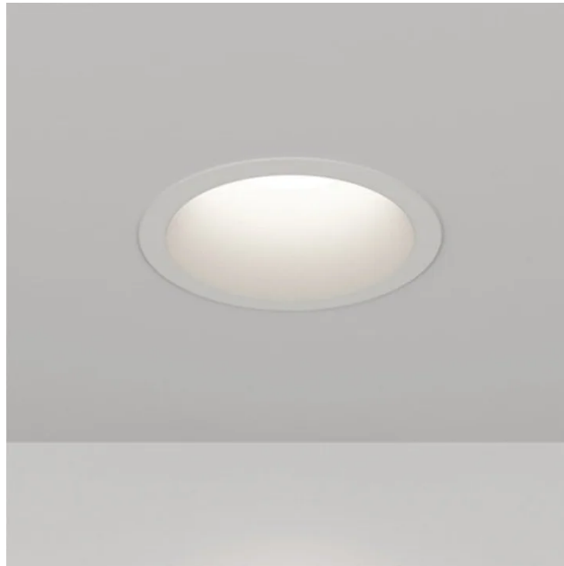
Fraxion3 Led, Lucifer Lighting ($510 and up)

Best Overall: Lucifer Lighting Fraxion3 LED Recessed Downlight